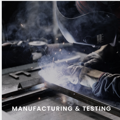
MANUFACTURING & TESTING