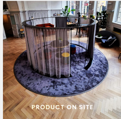
PRODUCT ON SITE