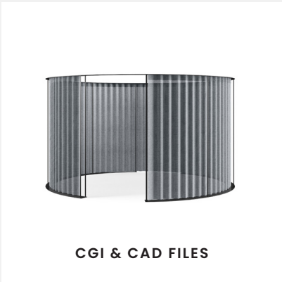
CGI & CAD FILES